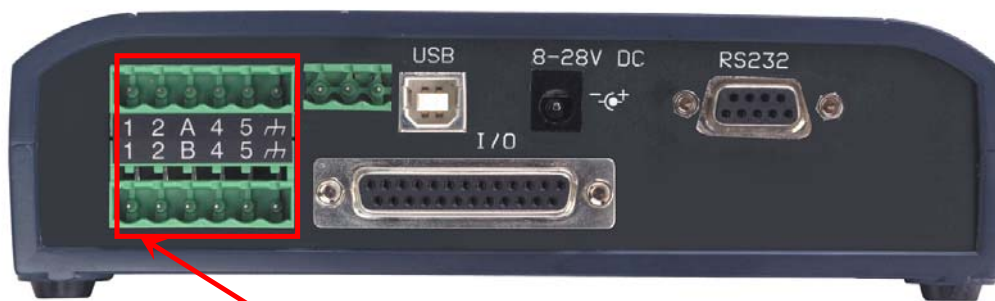
Input blocks A and B